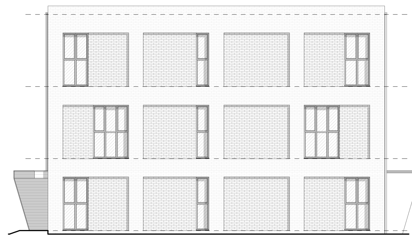
Left Elevation 1 : 100